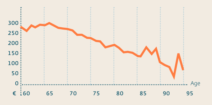
Average Expenses on Leisure Activities in Euro per Month

Figure 3: Average costs for out-patient care in euro per year (own figure based on SOEP data)