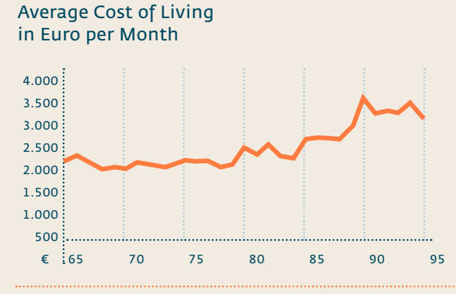
Figure 2: The retirement smile (own figure based on SOEP data)

From the start of pensionable age, the significance of nursing costs continually increases while consumption spending is increasingly less relevant (see Figure 1).