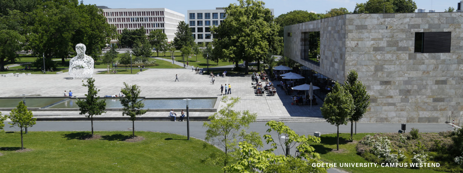
GOETHE UNIVERSITY, CAMPUS WESTEND